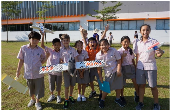
Lift Off in STEM Week

End of term: Fri, 12th Oct Term 2 starts: Mon, 22 nd Oct OBV Yr8 & Yr 9G: 22nd – 26th Oct