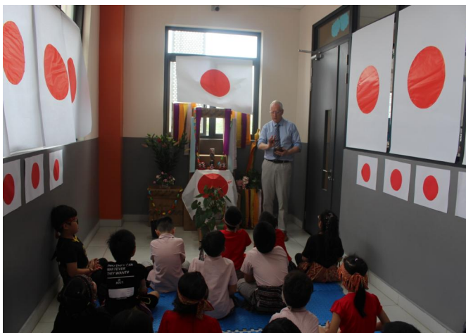
Primary Tour to Japan

You are encouraged not to schedule holidays during school time. If your family holiday is during school time, let the school know in advance and talk about what arrangements can be made for your child. Depending on the circumstances the school may be able to provide tasks for your child to complete while they are absent.