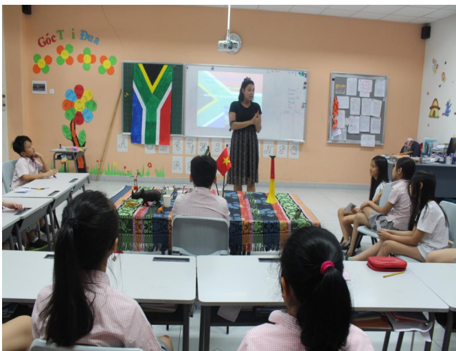
Primary Tour to South Africa