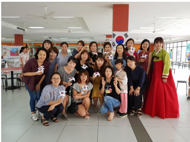
Korean Moms at International Day