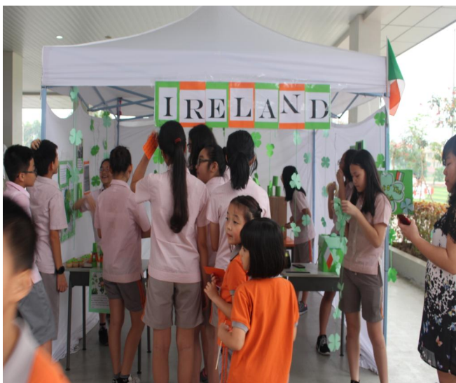
Ireland Booth at International Festival