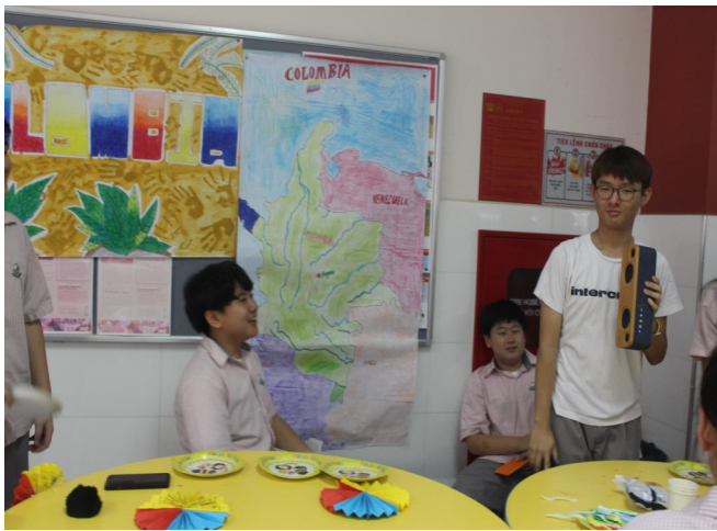
Columbia Booth at International Festival