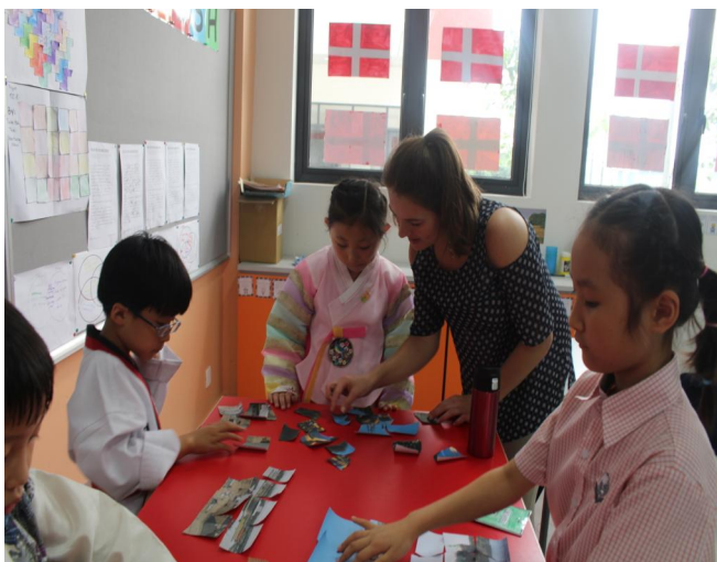
Primary Tour to Denmark