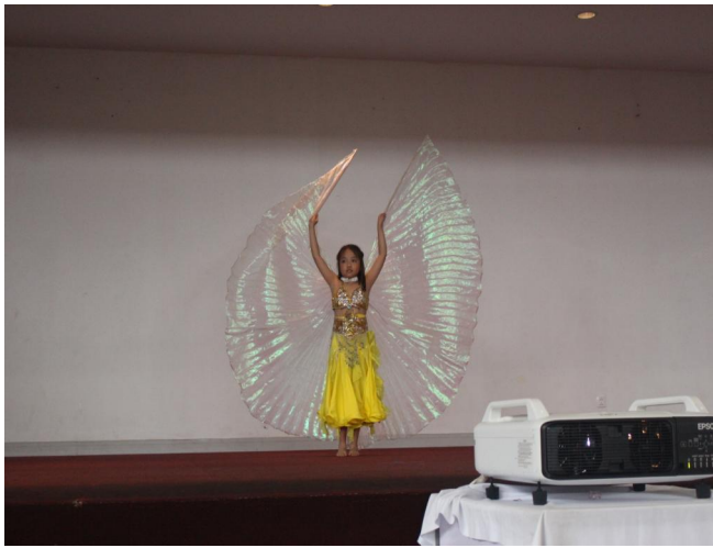
Performance of our student at International Day Show