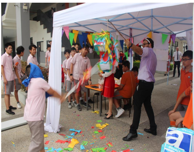
Mexico Booth at International Festival

of Education and Training. This is SVIS's annual humanitarian activity to educate students on virtues and raise patriotism, national pride and the spirit of mutual affection for our veterans. Previously we raised 20 million VND in the 2015-2016 school year and 33 million VND in the 2016-2017 school year.