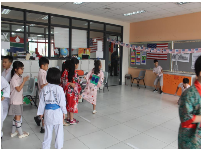
Primary Tour to the USA

world drown and many of those drowning could have been prevented if the person knew how to swim. Please encourage your child to take this opportunity to learn how to swim or to improve their stroke correction.