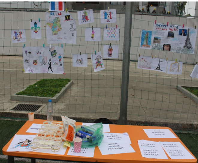
France Booth at International Festival

openly and confidently about school work, it can be an indication that he/she is coping well. If there are signs of shyness, reluctance or hesitation, it could mean a lack of both confidence and understanding.