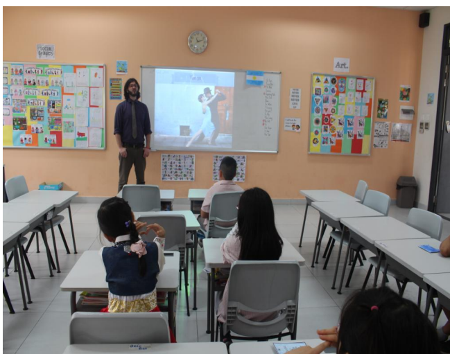
Primary Tour to Argentina