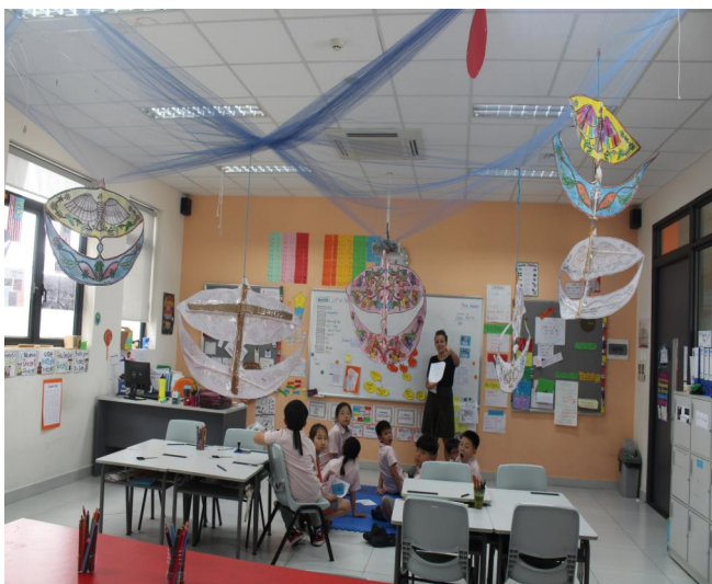
Primary Tour to Malaysia

Lastly, I would like to give a big thank you to all the parents that made it out to the last coffee with the counselor. If you were unable to attend the session but would still like some information on how to help your children deal with stress during the exam period, please email the office for a copy of the presentation.