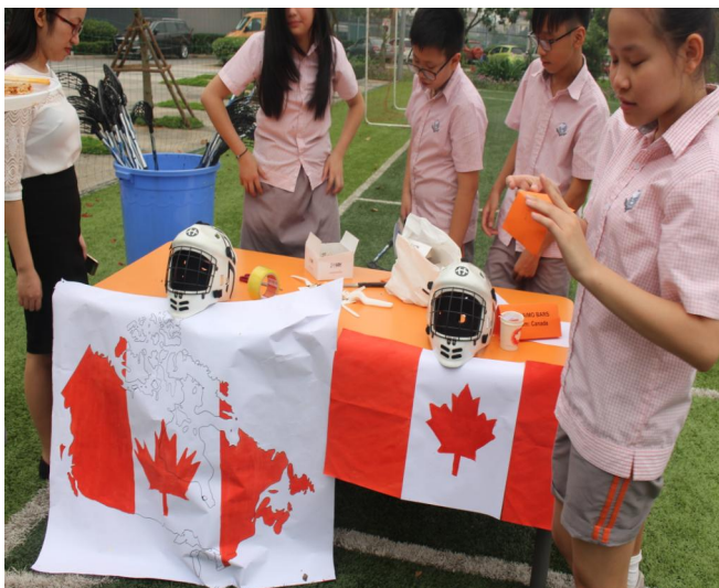
Canada Booth at International Festival