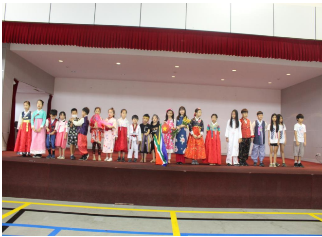
Primary Fashion Show on International Day 23/04/2018