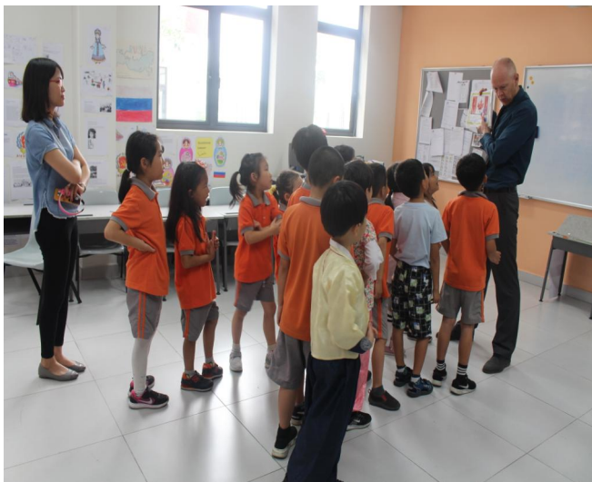
Primary Tour to Russia