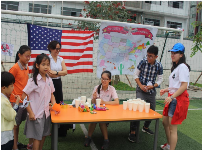
The USA Booth at International Festival