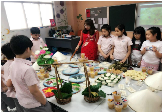
Primary Tour to Viet Nam