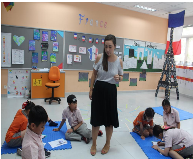
Primary Tour to France