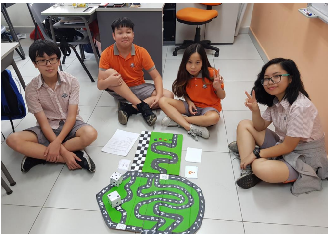
Year 8 International students working on a STEM project