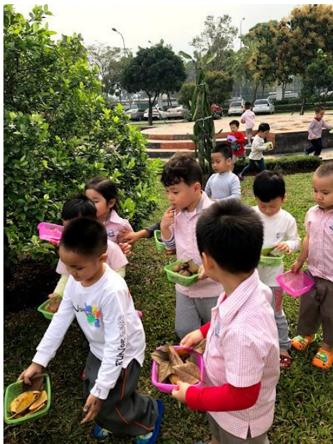
KIK students exploring in school grounds for their science projects