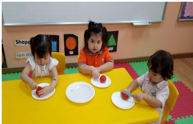
KIK students learning how to improve their coordination skills