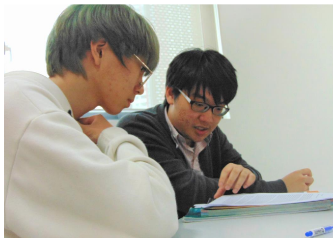
Even our high school students benefit from peer tutoring

The report cards that were not collected by parents have now been given to the students for your convenience.