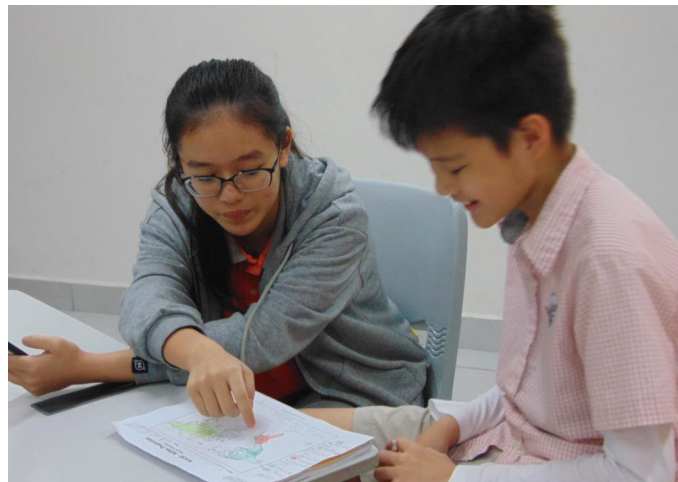
A tutor and a student labeling a world map.