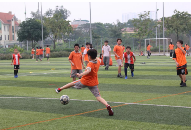
Year 4-6 football game vs SIS@Ciputra