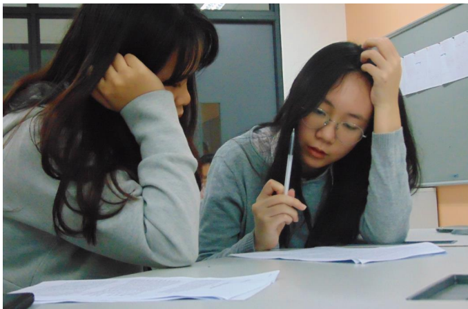
Peer tutoring is good for both the student and the tutor!