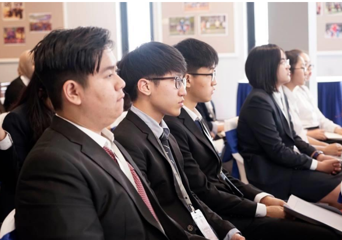
Our students hard at work at the MUN