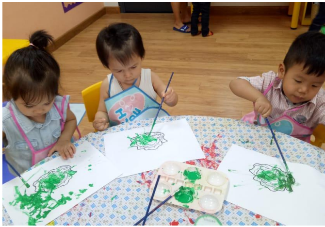
Our KIK students engaged in ART activities