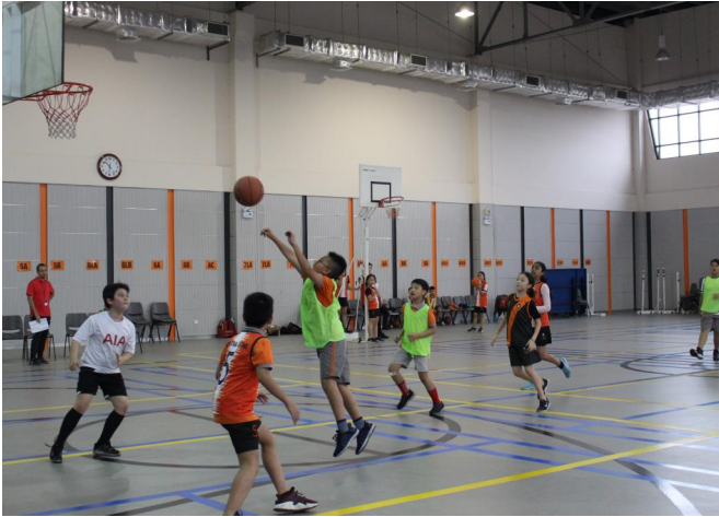
Year 4-6 basketball game vs SIS@Ciputra