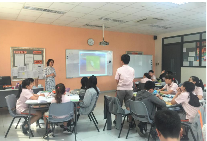
Group work is a great way to learn.