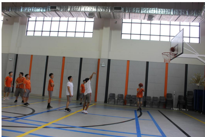
Students practicing basketball in the MPH

We have some exciting news for our secondary school learners; this