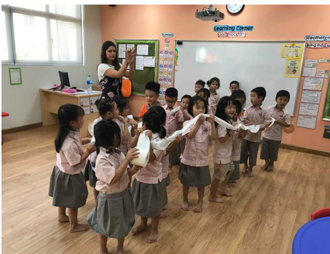
Prep class learning how important it is to work together as a team

successful new school year with much joy and great achievements in a safe educational environment.