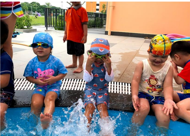
KIK students enjoying their time in the new small swimming pool

school group. All our teachers hold a Bachelors of Foreign Language Pedagogy and have graduated from the College of Pedagogy or the College of Early Childhood Education.