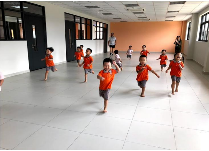
Students from Dolphin class running around in PE lesson