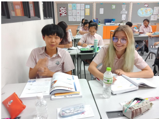
Students from Year 7 International in Maths class