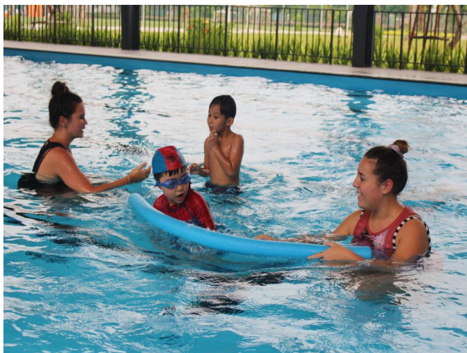
Students learning how to swim in the new swimming pool under the guidance of our Teachers