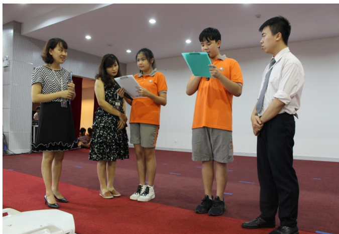
SVIS teachers and students actively preparing for the Commencement Ceremony