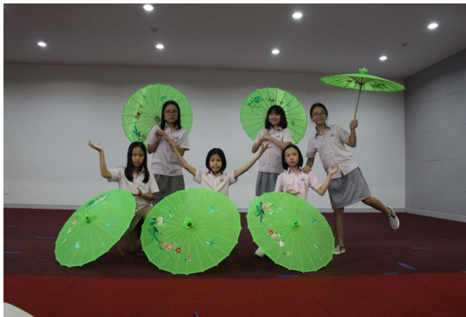
SVIS students practicing a dance to perform on the Commencement Ceremony