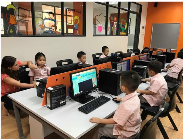
Prep class learning how to use computers in the ICT room