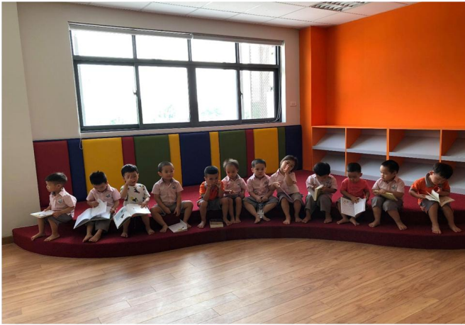
Dolphin class reading books in the Library