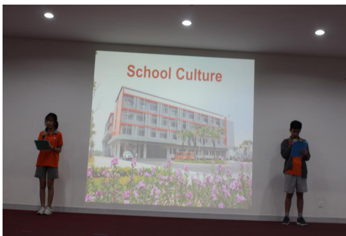
SVIS students practicing their presentation for the Commencement Ceremony

year Singapore International School will be attending the Viet Sing Swing university fair. There will be over 70 universities at this fair, which will be hosted by UNIS next month and it will be a great opportunity to meet the university representatives and see what they have to offer.