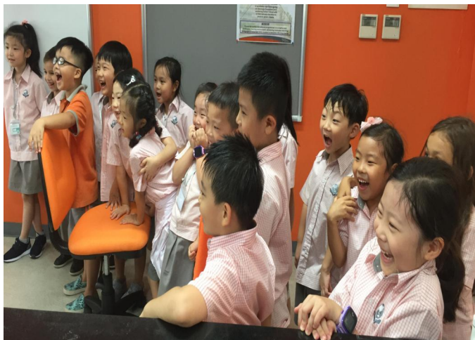
The students from Year 1 International enjoying seeing science in action. They also promised to be good in the following weeks so they will be invited back to the lab.

Parents and families are encouraged to support Primary School teachers by constantly reminding children that a good education is very important, and that we are all on a significant learning journey together at SIS@Gamuda Gardens. Primary School teachers will engage students in a wide variety of experiences focusing on academic, social, physical and emotional development. An important part of the Primary School program is the Home Reading Scheme which involves parents and family members listening to children read at home. Please participate enthusiastically to show children that you value reading. Also, spend time talking with your child to discuss their books and what he/she is learning at school.