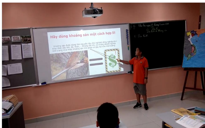
Geography class of Year 5 Integrated