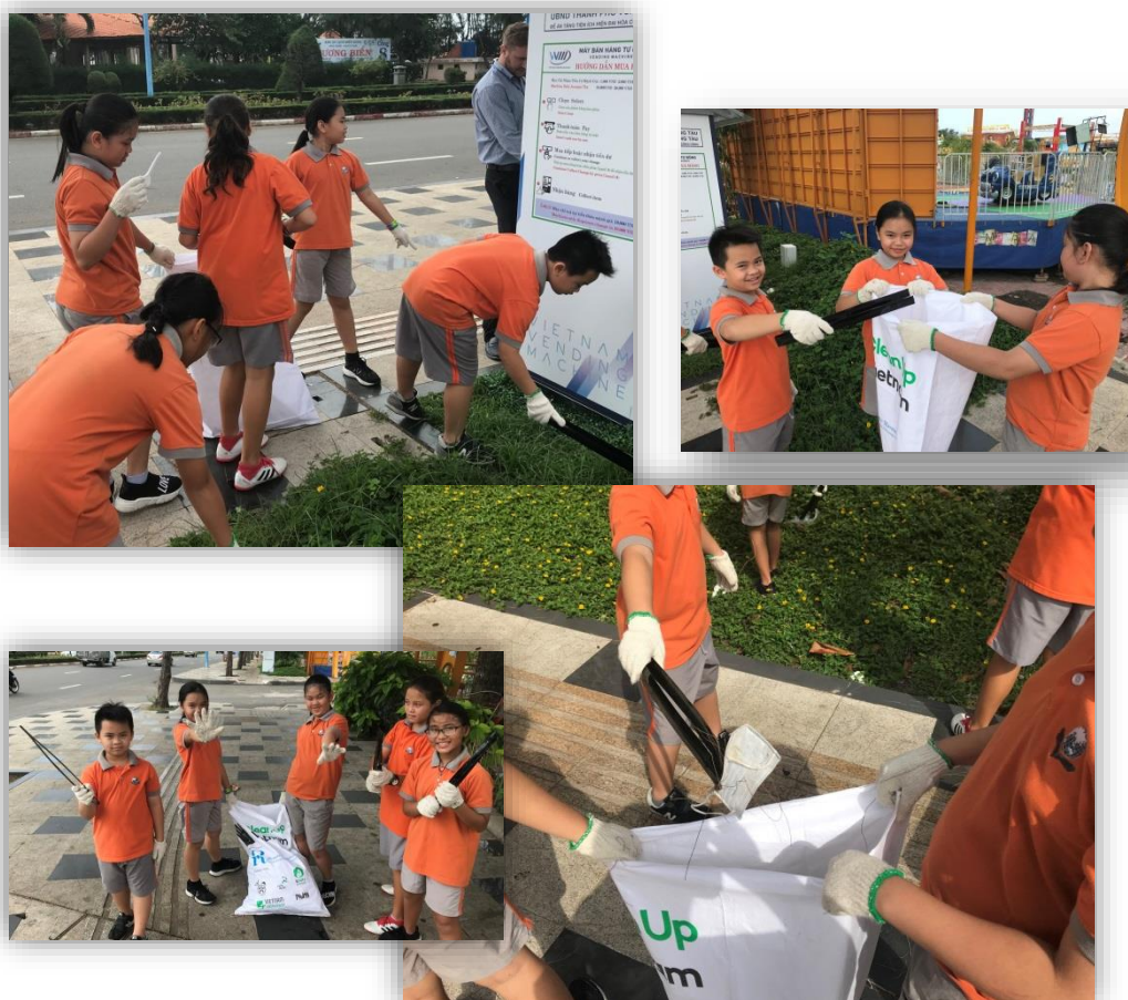
Pictured above: Year 5 International