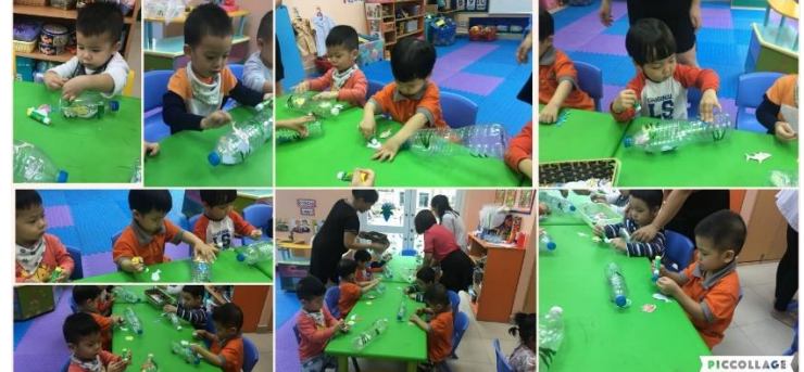
Prep Firefly Students Create Family Trees

Nursery Larva Class has been learning about sea creatures and animals that live in water. To further enhance their understanding, the students made their own aquariums. They pasted cutouts of tiny fish, sharks, turtles, octopuses and whales onto a water bottle to make a "Sea Creature Aquarium". They filled their bottles with blue-coloured water to complete their aquarium. The children were so proud and eager to show and share their masterpieces with friends. Through this activity, they were able to name and talk about the sea creatures they were pasting on their bottles. They used fine motor skills of colouring, cutting and pasting to complete the task then showed their confidence in talking about their work with each other. It was great activity for our Nursery students.