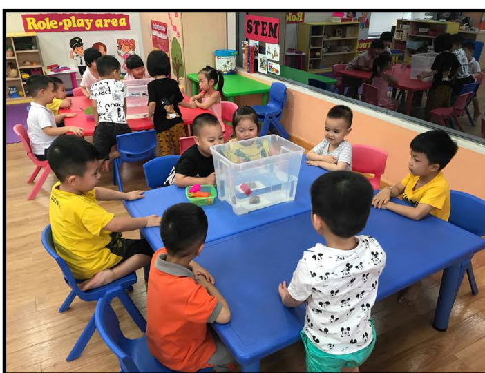
Our KIK students engaged in STEM activities