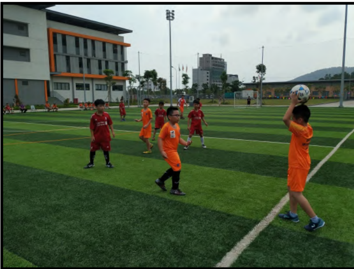
Shot of the team in action!