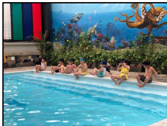
KIK's students are excited about the swimming lesson