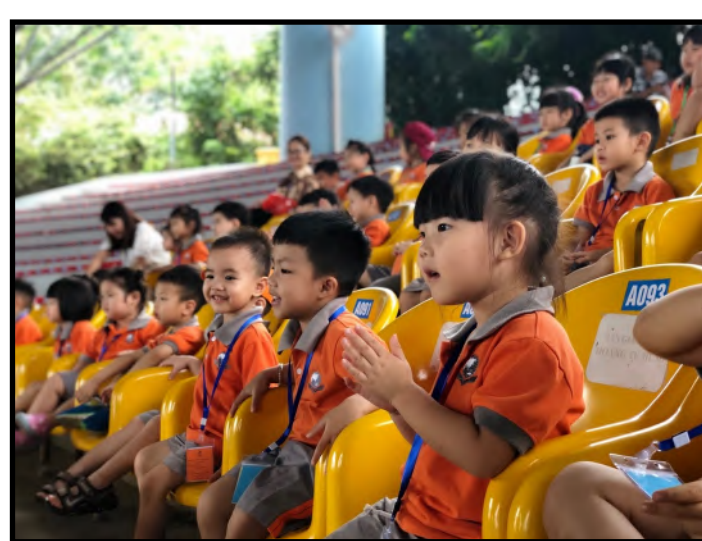
KIK's students watching the dolphin show

Finally, the office team, are always willing to answer all questions from parents 24/7, so please don't hesitate to contact us anytime for any matters related to the study of your children.