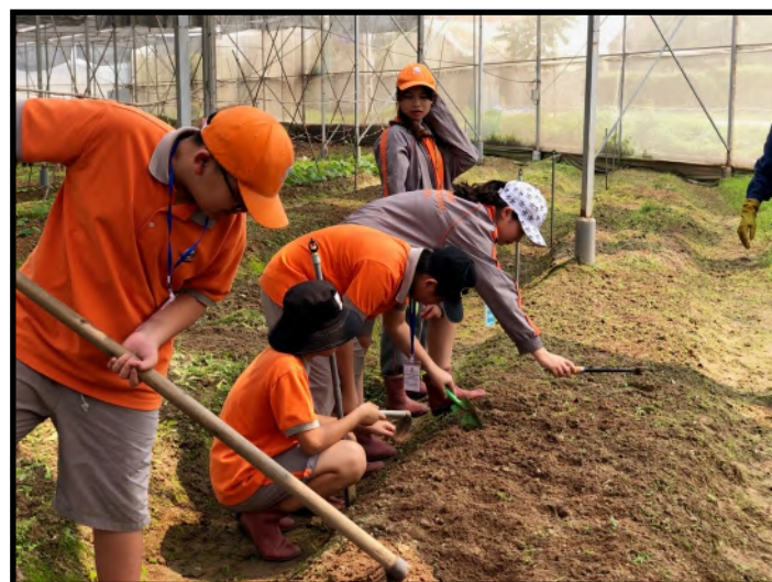
SIS's students experience "One day as a farmer"