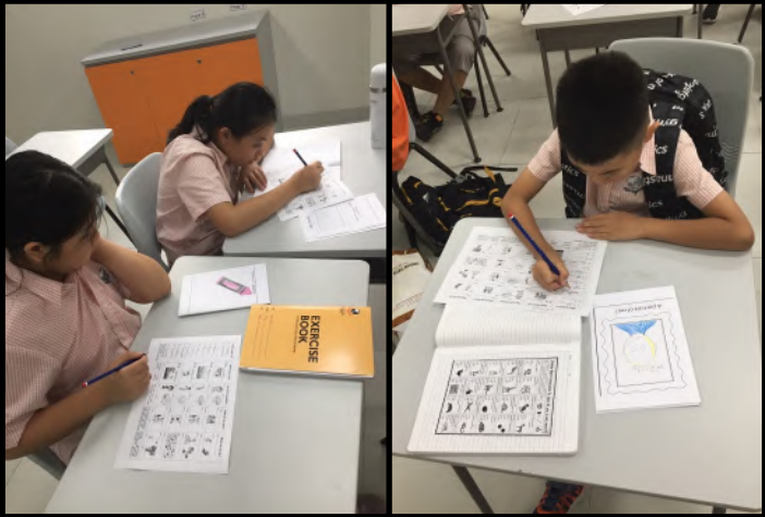
EFL students receiving extra assistance to reach the quality levels required for success in the English curriculum