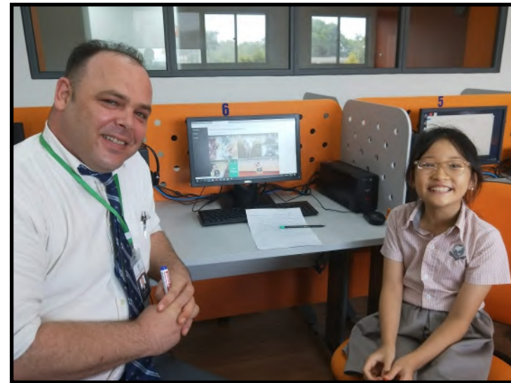
A student very proud of her efforts in producing her website