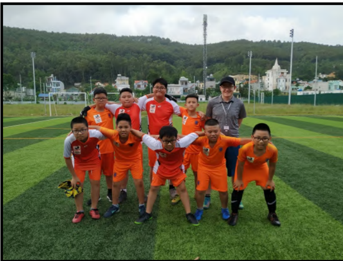
Our sporting heroes!

I would like to thank all the parents, who took time out of their busy day to support their children, and the rest of the school for their passionate support.