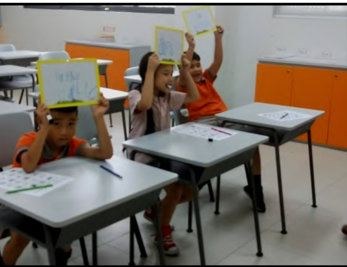
Excited Year 2 EFL students using "Show-me" boards