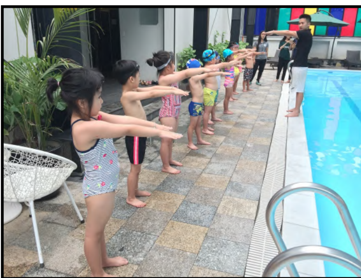
Prep students in swimming lesson

The excursion to watch the dolphin show in Tuan Chau was also a remarkable venture in April. Associated with the theme of sea animals, teachers of KIK and admin successfully organized an excursion to enlighten this topic more. This was a great opportunity for KIK students to observe and learn about marine species. This was also an opportunity to help them increase in confidence when participating in collective activities and become confident communicators.