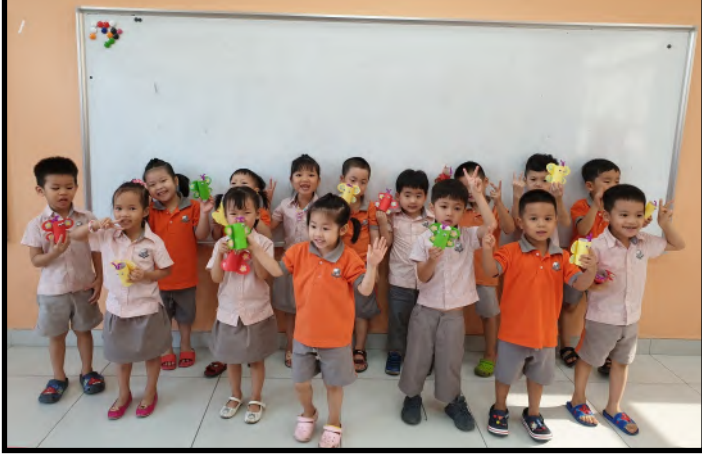
Our KIK students proudly displaying some of their craft creations