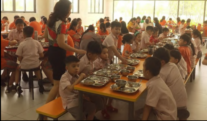
Emphasis has been placed on canteen etiquette and improving social interactions during meal times recently