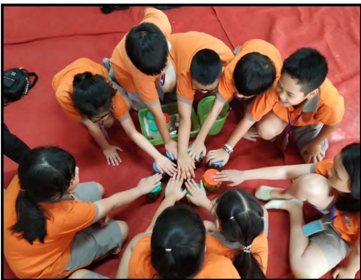
Students above producing pickles at the high tech farm day