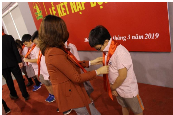
Young pioneers ceremony