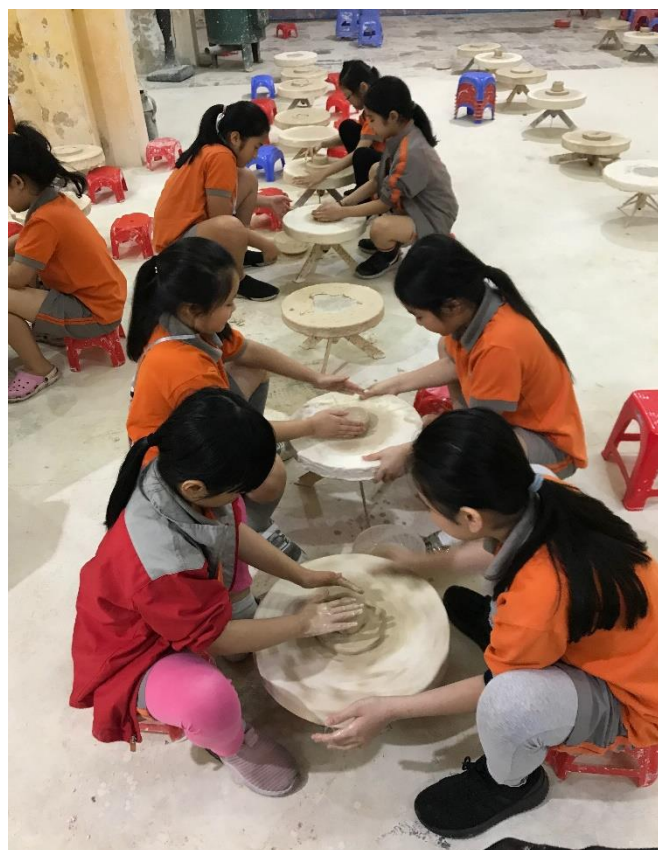
An excursion to Bat Trang village