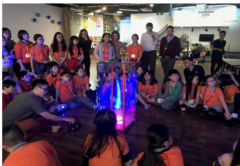
An excursion to American STEM center