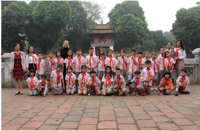
Grades 3 students in the temple of literature