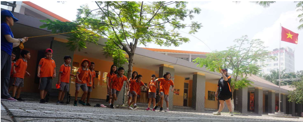
Students enjoyed participating in the OBV's course at Saigon South