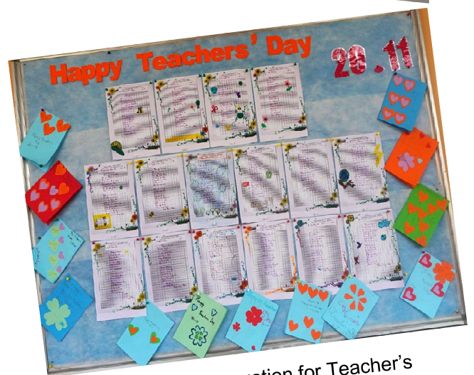
Classes' decoration for Teacher's Day