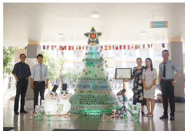
Teachers and Students at SIS@SS with the STEAM project