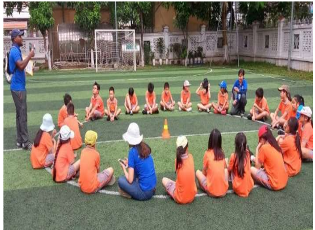
OBV's Activities for Year 4 & 5 students