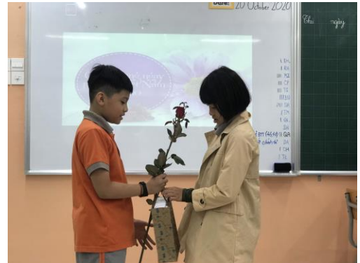
Showing gratitude on Vietnamese Women's Day

The Year 3's took the Year 1's outdoors for paired reading. The classes thoroughly enjoyed listening to one another read and are becoming Confident Communicators!