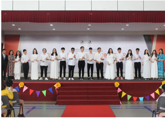
Our Year 9 students celebrated their last year of secondary school. Next year they go to IGCSE1 or rejoin a Vietnamese school. We wish them all the best.