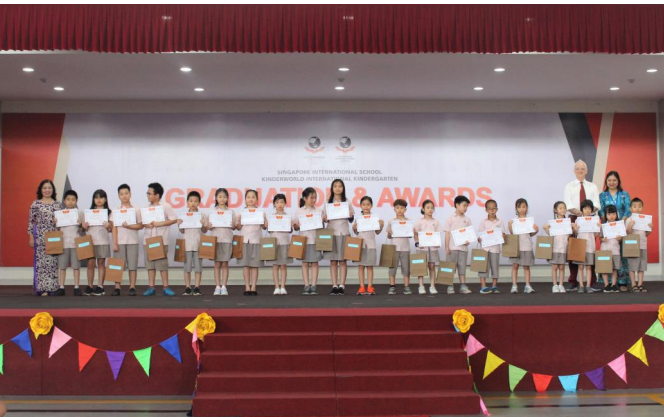
We are proud of our SVIS Primary school high achievers. Well done students!

to if they chose to do so. Students were expected to wear their masks when they arrived and left the school. We are hoping by the time we start the next school year in August that this is no longer necessary.