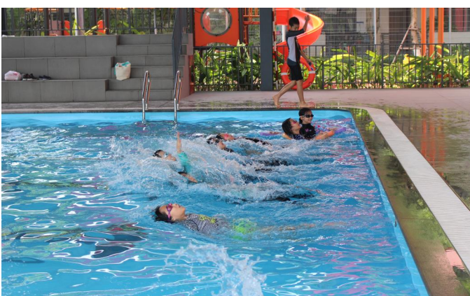
We ended our school year with a swimming gala. Our students enjoyed being in the water and showing off their talents.

During term 3, teachers and students strictly followed preventative measures which were instructed by the Government as well as from the Ministry of Education and Training: we reduced face-to-face interaction with others and implemented social distancing which contributed to the success of Vietnam's fight against COVID-19.