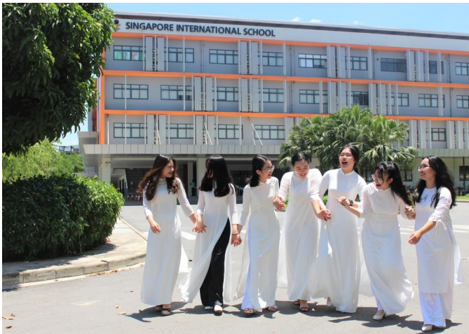
Year 9 girls in their traditional Ao Dai.