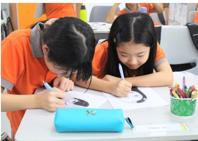
Our students are enjoying their Art lesson, creativity is encouraged in our school. We have many talented students.