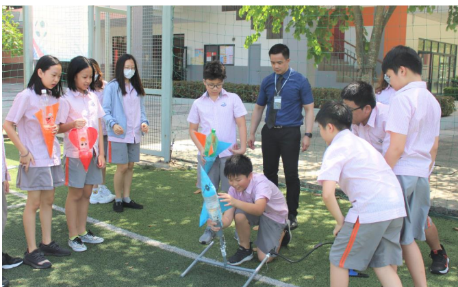
Nothing like a STEM competition to end the school year. Students enjoyed this activity and were excited to see whose rocket could go the farthest.