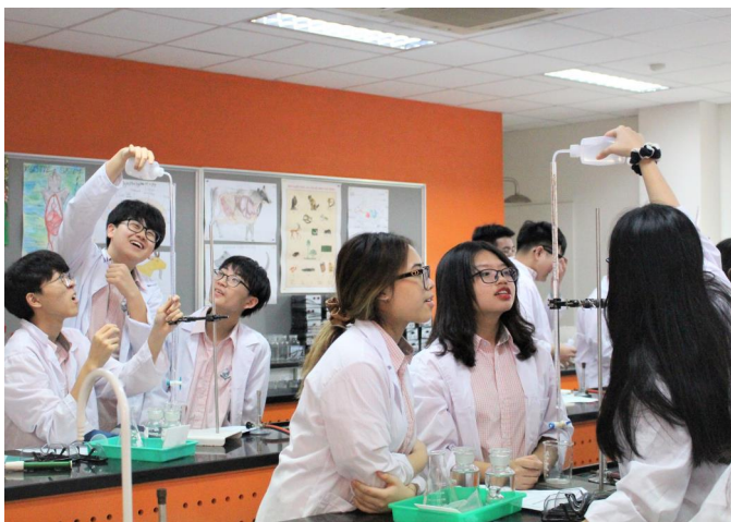
Our Scientist are hard at work and having fun in doing so!