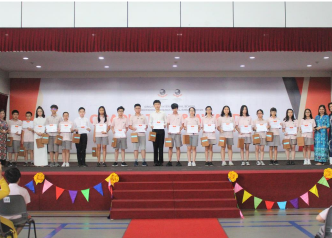
We are proud of our SVIS Secondary School high achievers. Well done students!