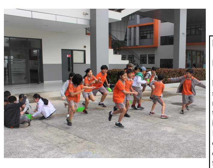
OBV activities continuing