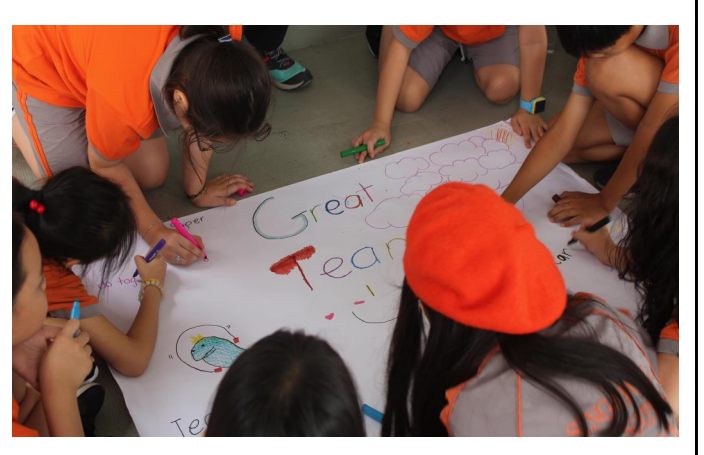
Students engaged in OBV activities.

Students participating in OBV activities