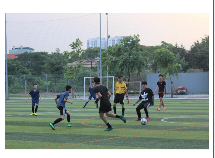
Students enjoying the match and displayed excellent skills.