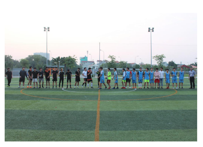
Our football team after a match against Hanoi Academy School,