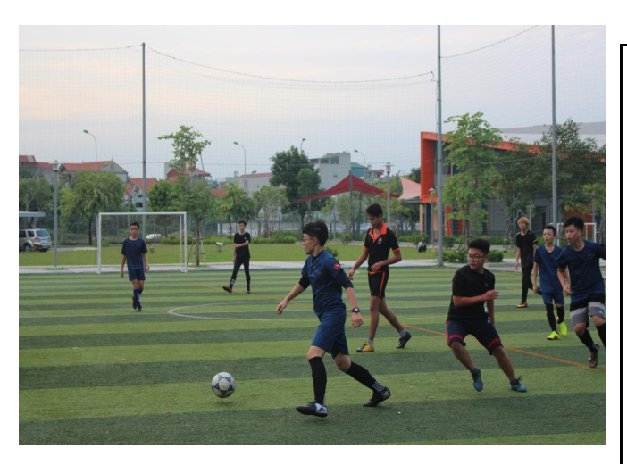
A football match between SIS and TH School