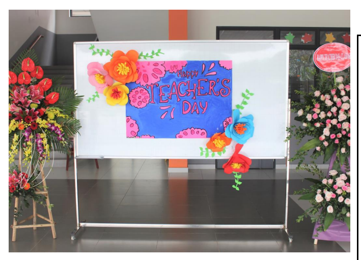
We enjoyed a wonderful Teacher's Day at SIS@Gamuda Gardens