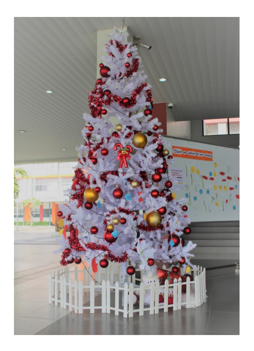
Our Christmas "Giving " Tree

Students you must the money to the ladies in the front office. Donations are as follow