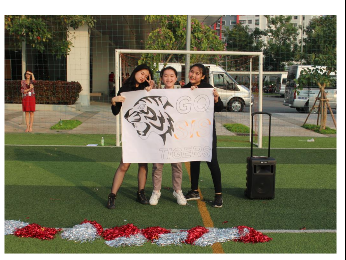
"SIS Tigers" cheerleading team coordinators