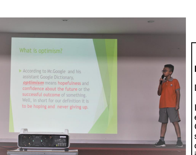
The Year 6LA presentation on the virtue " Optimism" during assembly