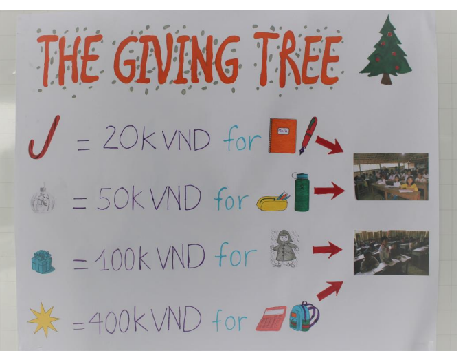
The donations are given to Blue Dragon Foundation to purchase items for the underprivileged children.