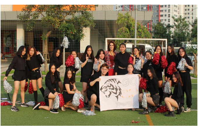
Our first ever cheerleading team with our Principal