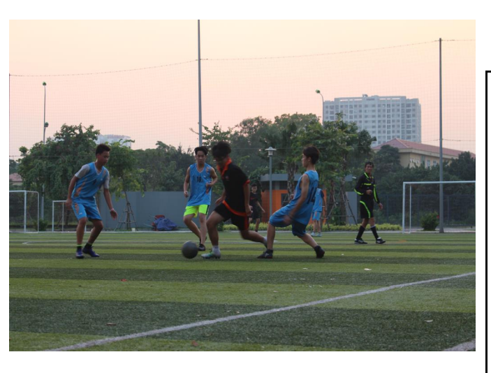
Our boys give of their best