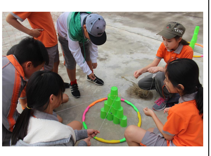
OBV team building activities.