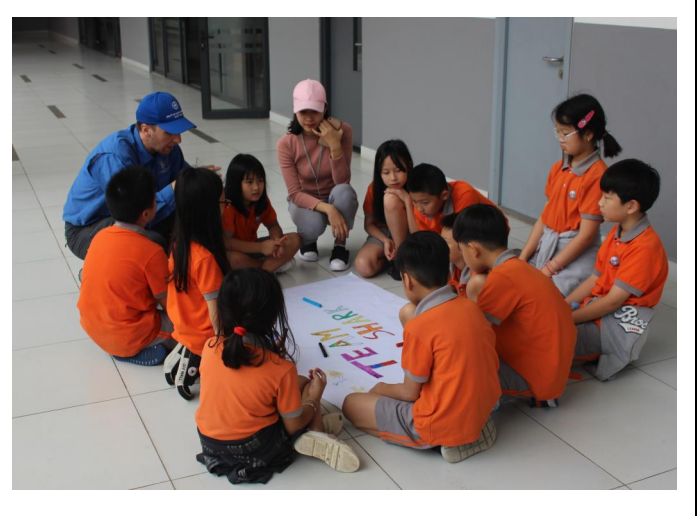
Our Year 4 students engaged in team building activities during the OBV program