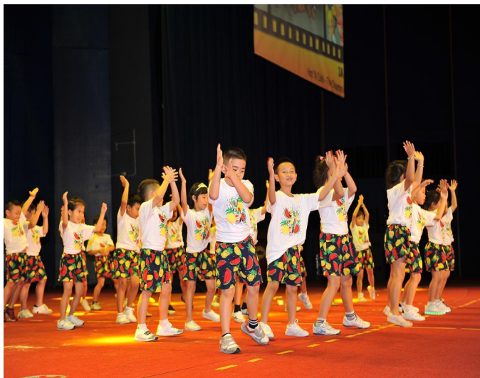
End of Year Concert Students' Performances