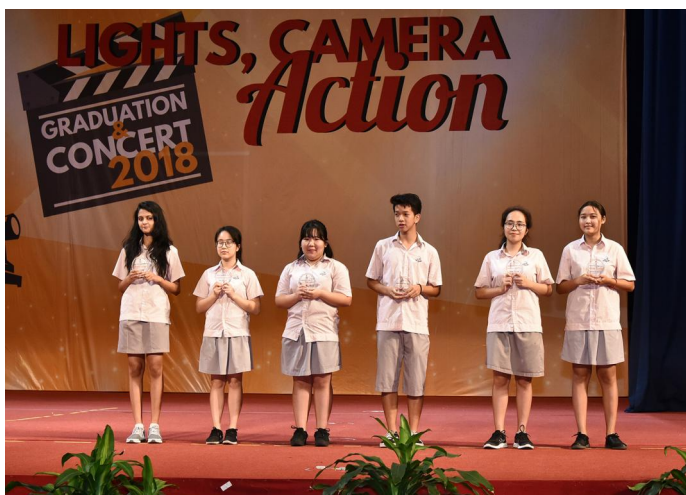
High School Academic Champions