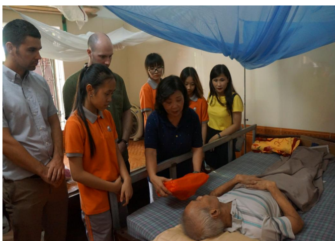
SIS Teachers and Students giving gifts to one of the veterans at Duy Tien War Invalids Caring Centre