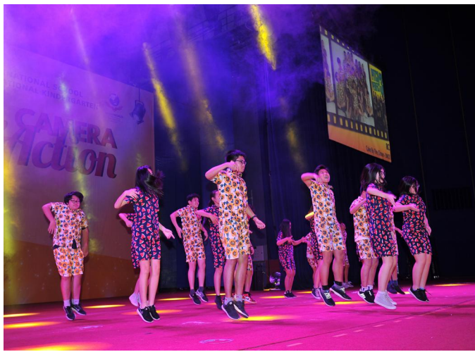
End of Year Concert Students' Performances