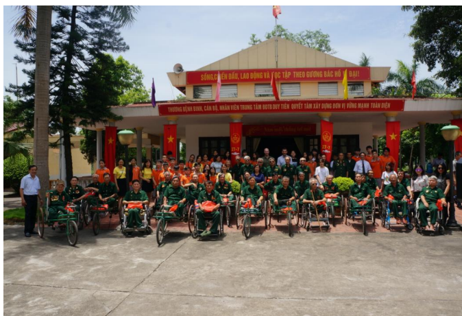
SIS Teacher and Students with the veterans at Duy Tien War Invalids Caring Centre