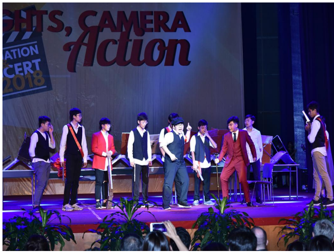
End of Year Concert Students' Performances