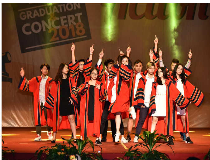
End of Year Concert Students' Performances