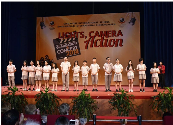
Middle School Academic Champions