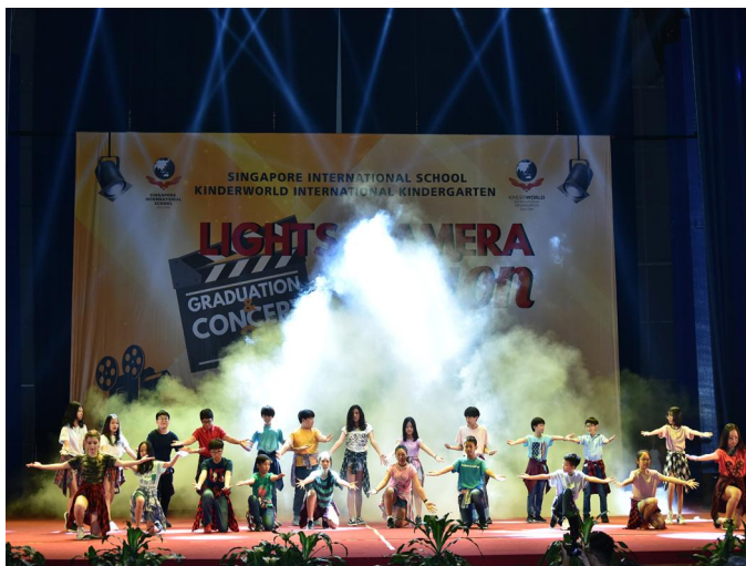
End of Year Concert Students' Performances