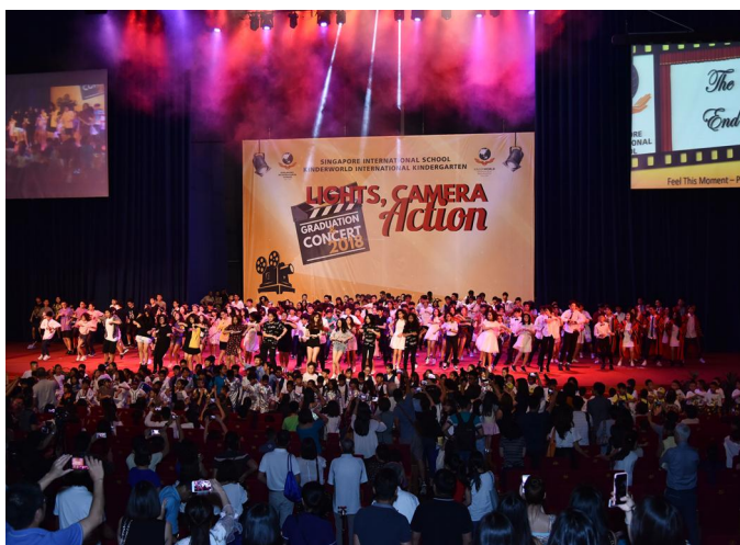
End of Year Concert Students' Performances– The Finale