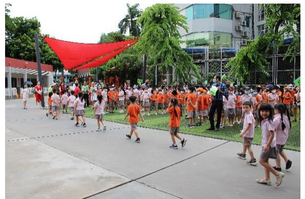
Students participating in the Fire Drill

This month we had our first practice Fire Drill in order to be prepared for a real emergency. Children used both internal and the fire escape stairs so we could exit the building quickly. We were able to evacuate all of the students and staff in record time. In the event of a real emergency, the students will be taken off of the property to assemble in Pho Van Phuc near the Japanese Embassy. Children will NOT need to cross any streets to safely assemble there.