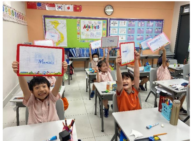
Y3L Students studying the 5 types of vertebrates

The KinderWorld Teaching Model is a research based initiative that is designed to dramatically improve student achievement. In the photo below, the students are all answering the question on their whiteboards and holding it up for the teacher to see. Rather than asking individual students, by having students answer this way, the teacher can see who understands what is being taught and who needs further support.