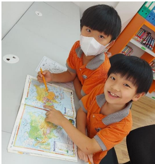
Y4L Students completing a Geography lesson in the Library. They are searching for specific countries on the continent of Asia

We ask that you please support your children to take advantage of this excellent resource to build their English proficiency. Teachers have provided each student with their specific login details. If you do have any questions then please contact your teacher for assistance.