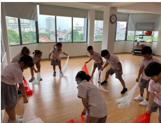
Class 1L demonstrating high and low notes with scarf movement set to Carnival of the Animals: Aquarium

As part of the SIS curriculum, students study STEM once per week. On October 14 th , we will have our first STEM day of the year, where students and classes can showcase the STEM projects that they have been busy working on this term. STEM projects are inquiry-based and incorporate the learning domains of Science, Technology, Engineering and Math. Many STEM lessons involve building models and simulating situations. Students are encouraged to ask questions about their projects that may change the outcome or results. A good STEM lesson ensures that students understand the concept and the connection to the real world. We look forward to seeing some excellent projects!