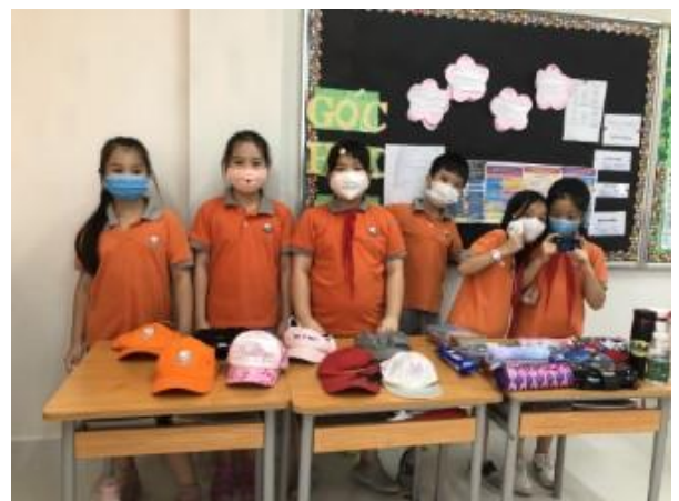
Y4C Students Practicing for their Virtues Play