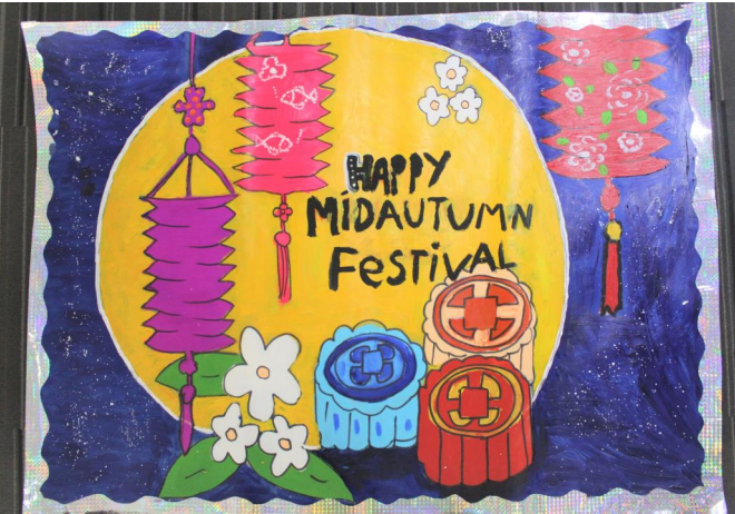
Our students are preparing for the Mid-Autumn Festival