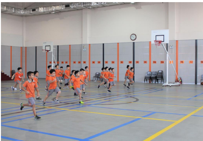
Our students enjoying their PE lesson