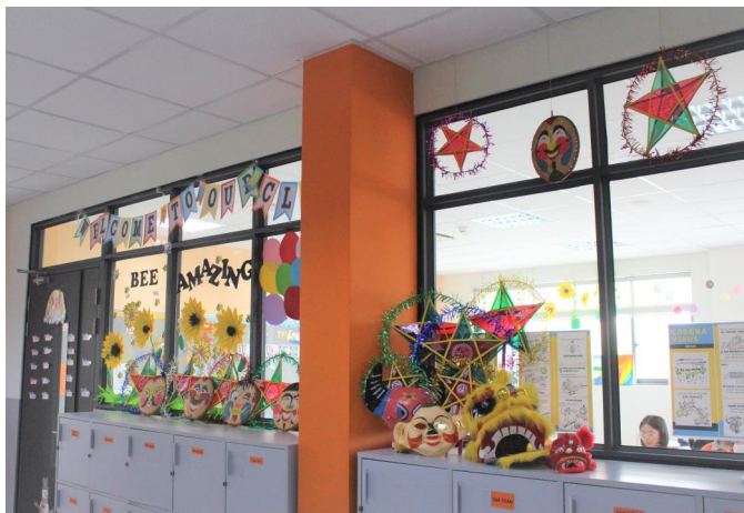
Mid- Autumn Decorations make our school vibrant and colorful.