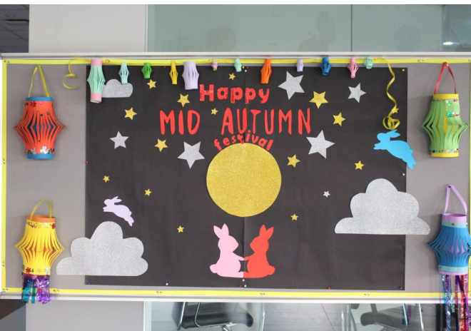
Celebrating the Mid-Autumn Festival is fun