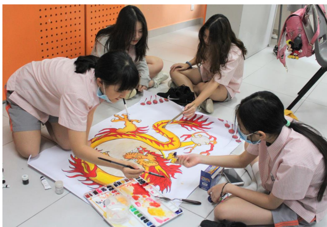
Our very artistic students are engaged in designing a dragon for their door.