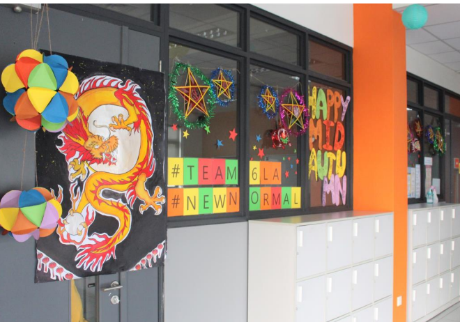
Beautiful student work is displayed on the classroom doors and windows