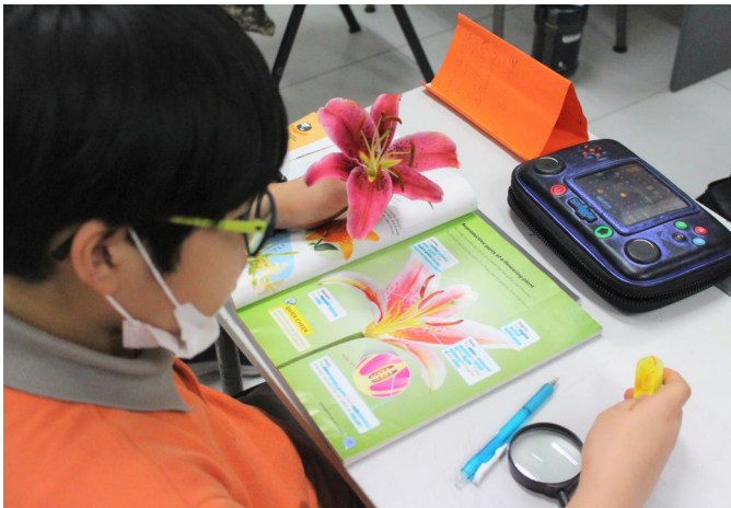
Year 6 students engaged in a science project.