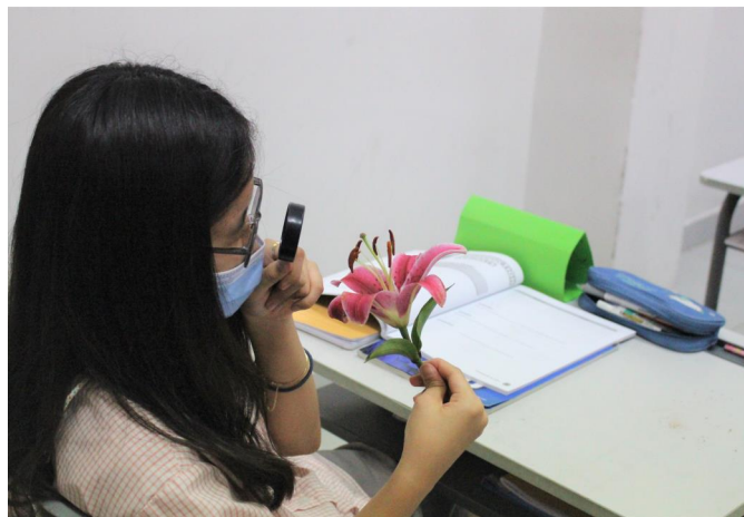
Looking through a magnifying glass to discover different aspects of the flowers