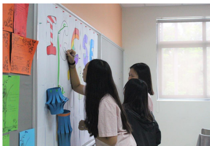
Students work in team to get the decorations up.