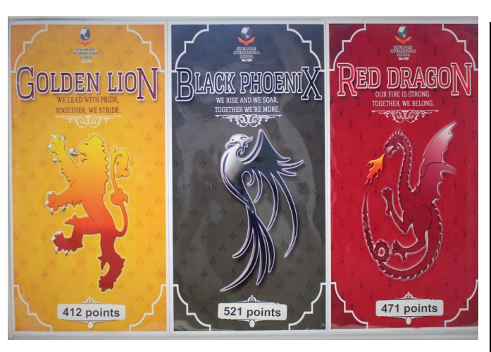
Our house points are very competitive! The next sports event will be held in January.