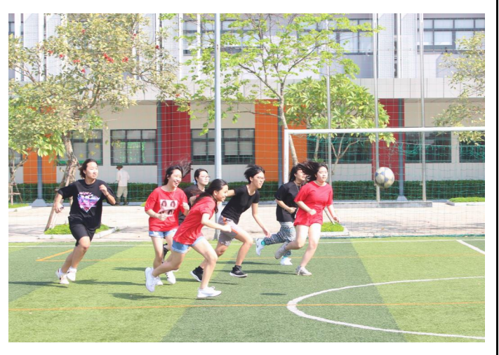
The Red Dragons and Black Phoenix Houses playing soccer against one another.