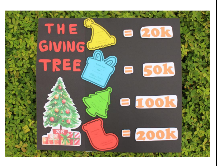
One of our Christmas Charity items is to donate money and get a voucher, the students then write their names on the voucher and hung it on the giving dress.