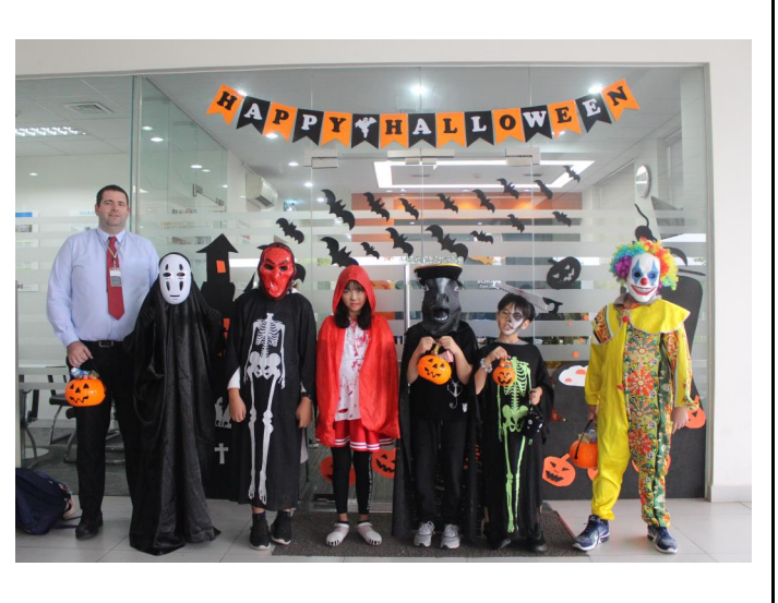
These are great Halloween costumes