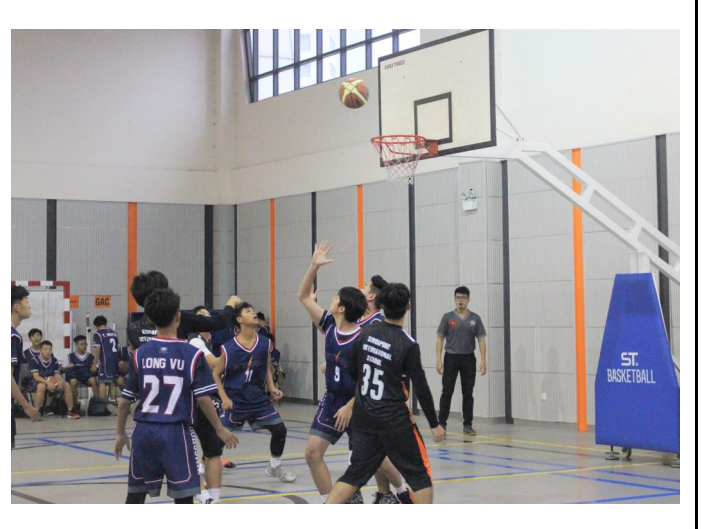
Our teams continue to play sports league against other schools Great team work is witnessed.