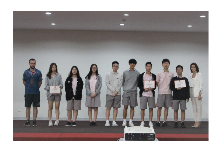
Students receiving a certificate for the "Most Valuable Player" Sports award,