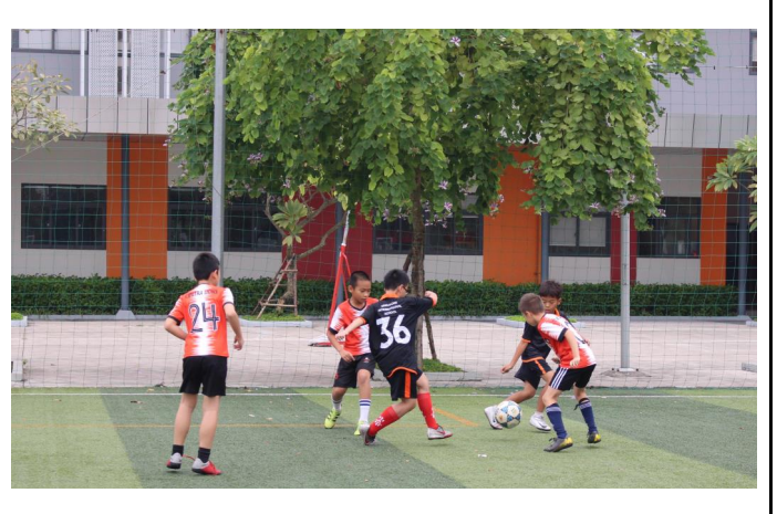
Ciputra Year 5 Boys played soccer against our Year 5 Boys with great enthusiasm.