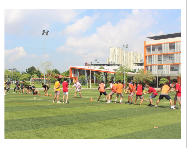
Fun activities amongst our houses, Black Phoenix, Red Dragon and Golden Lion