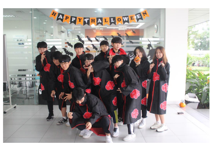
Our High School Korean Team, supported the Halloween competition. Great work Korean students!