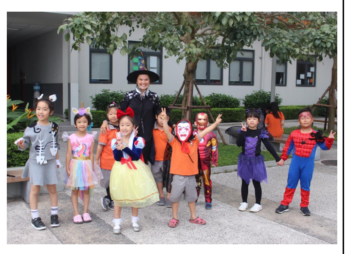
Students really enjoyed dressing up for Halloween