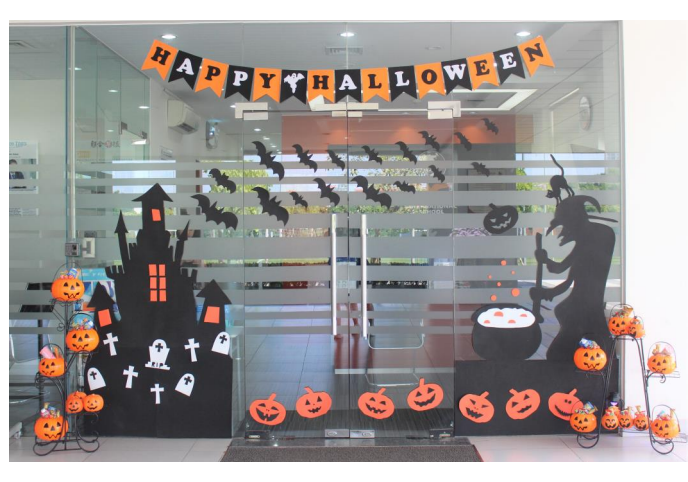
Our exciting Halloween decorations display in front of the office