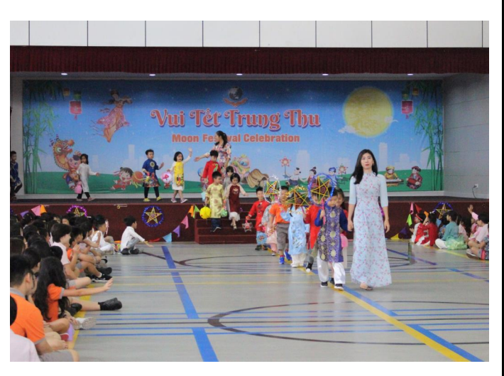
Our KIK students doing a Lantern walk for the rest of the