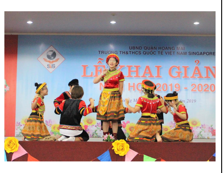
Year 9 students performing De Mi Noi Cho Ma Nghe