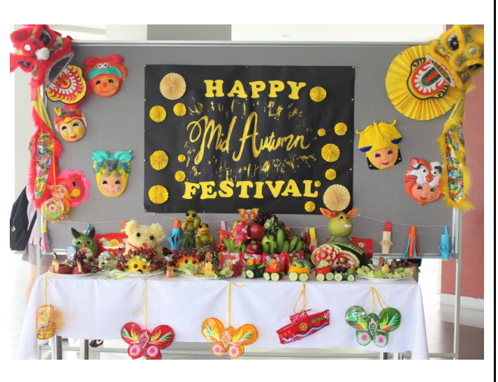
We celebrated the Mid-Autumn Festival at SIS