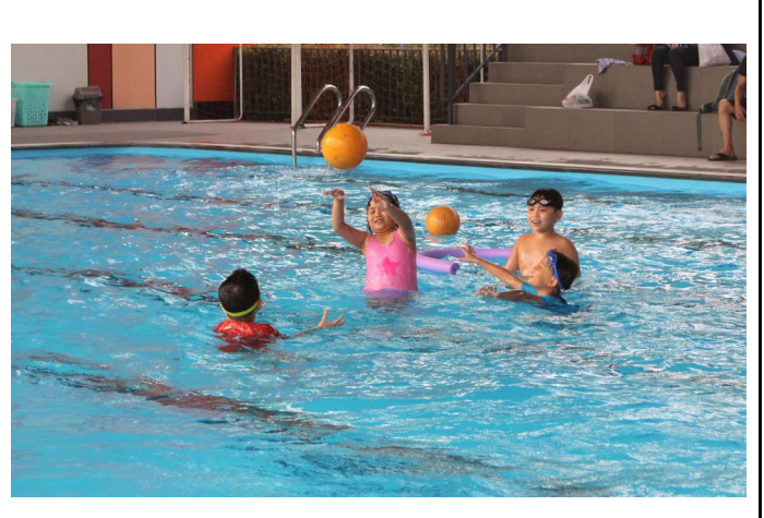
Students enjoy their swimming lesson and practiced for Swimming Gala