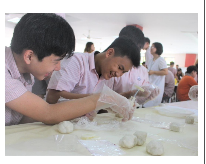
Such fun during the Moon Cakes making