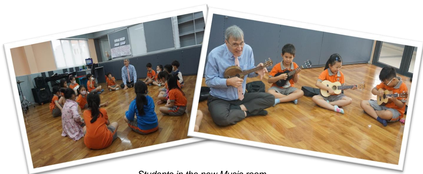
Students in the new Music room