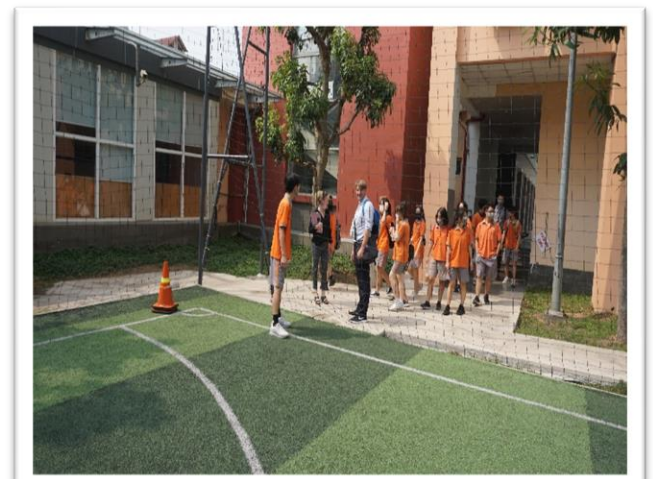
Hosting Singapore International