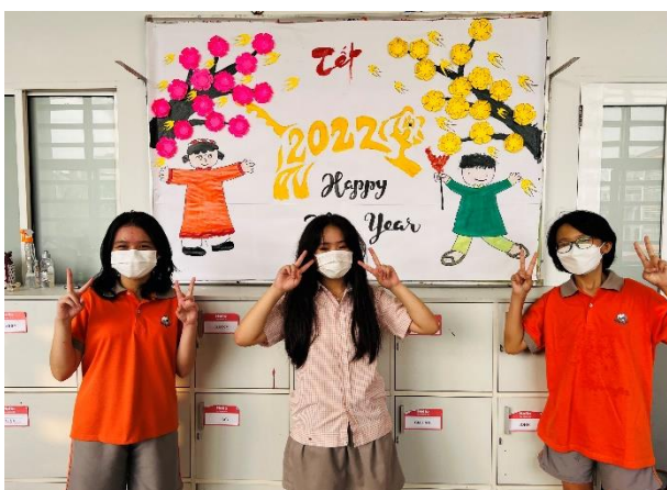
Class decoration for Tet 2022