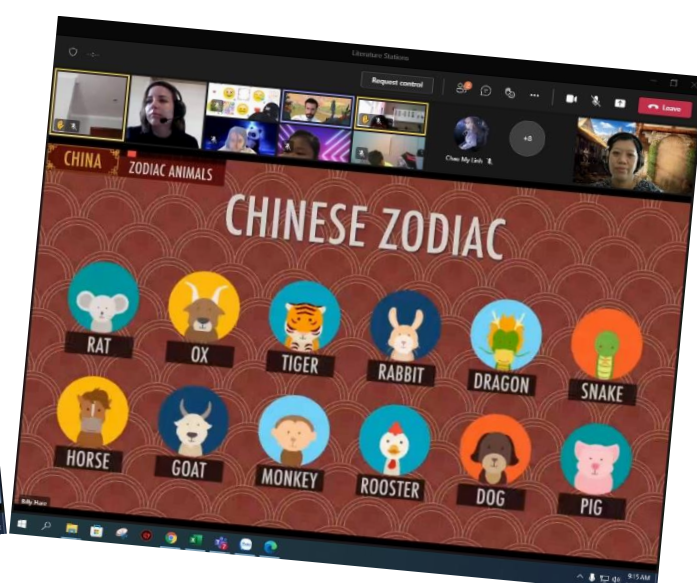
Lessons during online learning