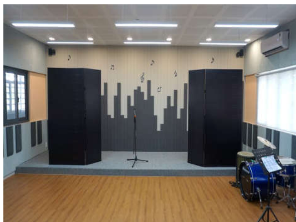
School Music room