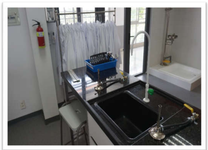
School Laboratory room