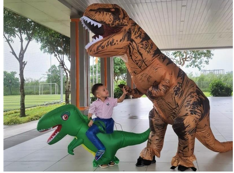
A Dinosaur High-Five is a great way to start the day!

19 December – 2 January: Christmas and New Year Break