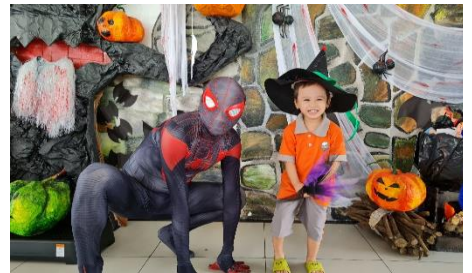
Cute Little K1 Witch with Spider-Man