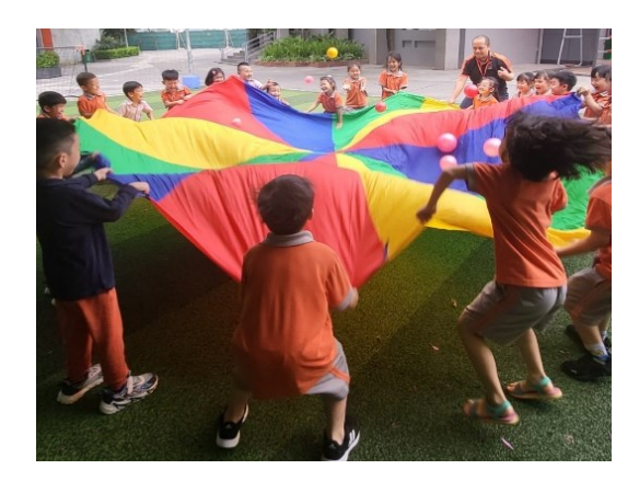
PrepA students work together to move the balls up and down in a game of Parachute Popcorn.