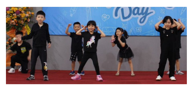
PrepL gave a very cute dancing performance to "Machu Picchu."