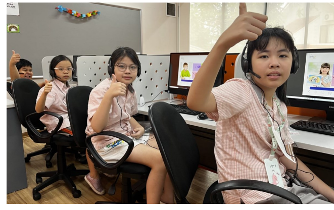
4A students are excited to use DynEd to develop their English language skills.