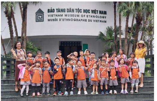
All students from Prep Rockets Class were really excited when they visited Vietnam Museum of Ethnology