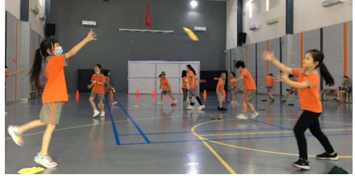
By simultaneously throwing and catching a beanbag with a teammate, 3A students are refining their hand-eye coordination in preparation for badminton.