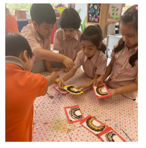
In Social Studies, 2A students made a mosaic inspired by Greek artwork.