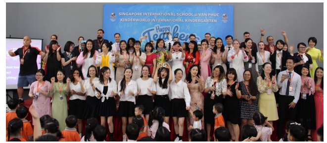
Thanks so much to all of our lovely students and their families for making this a very special Teacher's Day!