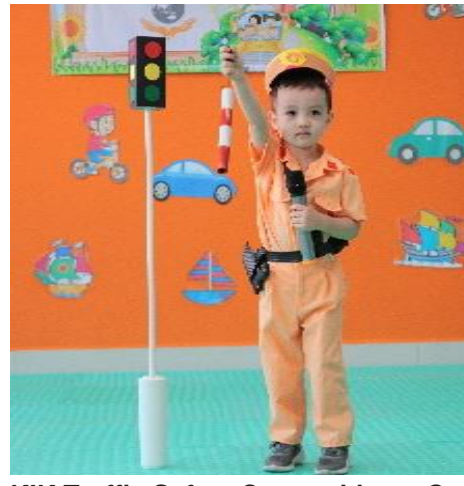
KIK Traffic Safety Competition – Our kindergarten students competed with songs, dances and performances to show their understanding about the importance of traffic safety.