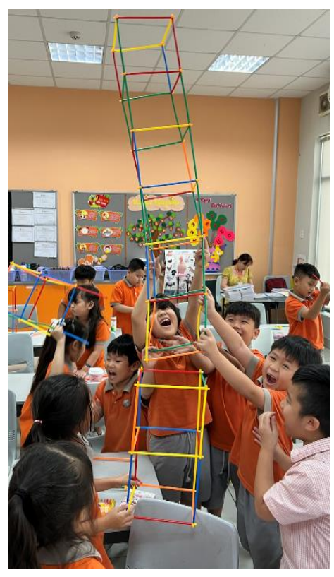
Building An Amazing Tower – Our Year 1 students test the stability of their towers, consider how to improve them, and try their new designs. STEM activities like these teach our students to be critical thinkers.