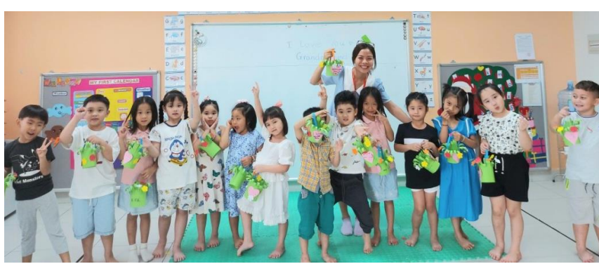
International Women's Day - Prep students make flowers for mom