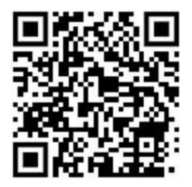
2. Google Play