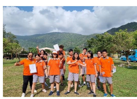
Outward Bound Vietnam -Year 9 students pose for a group photo at their mountain campsite (above) while Year 8 learn how to set up a tent (below).

April's School-Wide Learning Goal was to nurture Active and Responsible Citizens who understand and respect other cultures and who take responsibility for their actions and contributes positively to society. This can include respecting the rights of others, volunteering to help others, and being an active member of our school community. A responsible citizen understands that their actions have an impact on others and on society as a whole, and always tries to make positive contributions to their community.