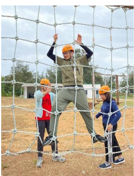
Outward Bound Vietnam – Teaches our students to overcome challenges through cooperation. A great way to build trust in others and to improve our self-confidence.