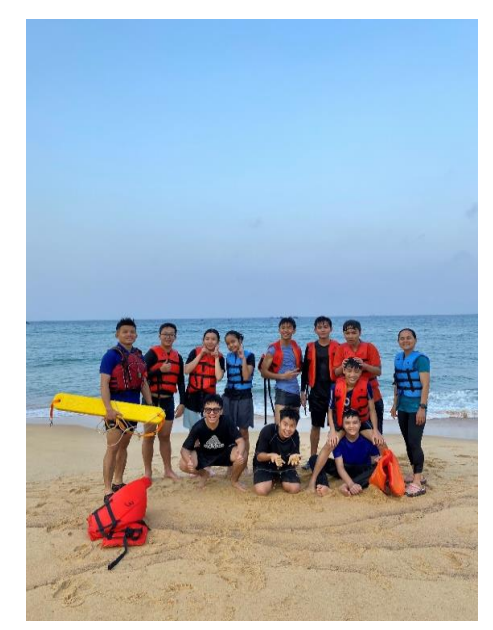
Year 8 Students – enjoy the outdoors with a swim on their first day at OBV.