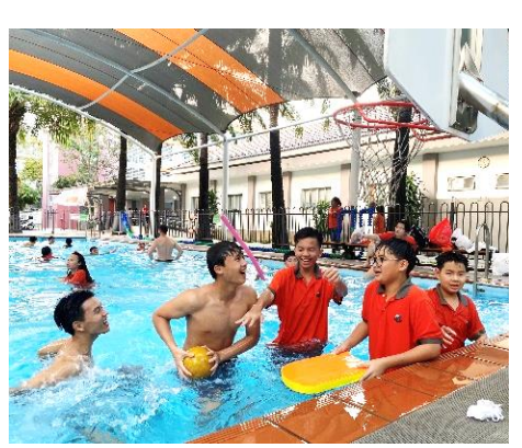
Our Secondary Students enjoying a break from the heat as they prepare for their water-basketball competition.