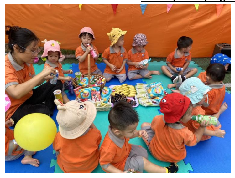
Nursery Camping at the Soccer Field.

sympatrize with and share with each other. Participating in activities together, taking responsibility for yourself and the community are the things that they have done as they look forward to the future